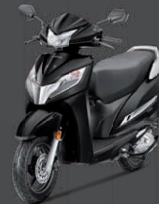
PEARL NIGHT STAR BLACK