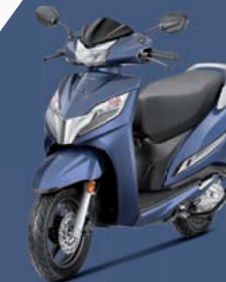
MIDNIGHT BLUE METALLIC