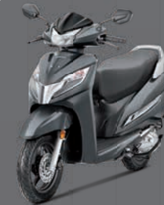
HEAVY GRAY METALLIC