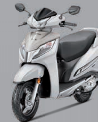
PEARL PRECIOUS WHITE WITH SALEN SILVER METALLIC